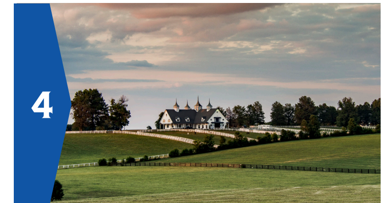
4 Lexington is Surrounded by 450 Gorgeous Horse Farms