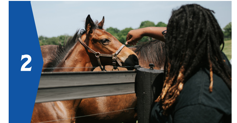
2 Lexington was Named of the Best Places to Travel in 2021 by Travel + Leisure