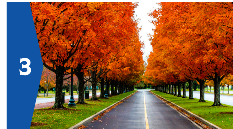
3 Lexington is a Day's Drive from 2/3 of the U.S. Population and Has 15 Direct Flights